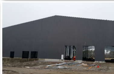
April 16, 2018 construction photos